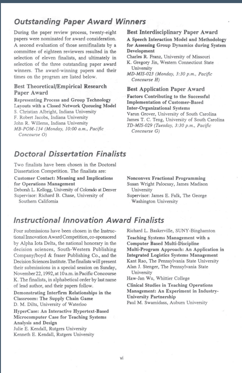
Doctoral Dissertation and Instructional Innovation Finalists, Outstanding Paper Winners