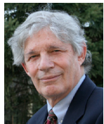
Stuart Kauffman on "Beyond Entailing Laws": The Illusion in Our Habit of Control and the Promise of a Habit of Enablement"

The 2012 DSI Annual Meeting will feature these exciting plenary talks by leading professionals and academics in the decision sciences.